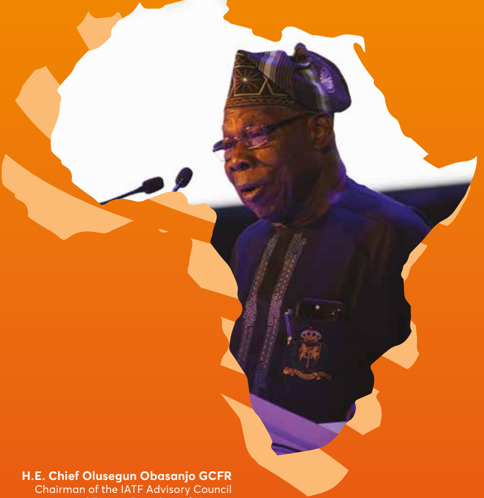
H.E. Chief Olusegun Obasanjo GCFR Chairman of the IATF Advisory Council and Former President of Nigeria

IATF2025 will provide a unique and valuable platform for businesses to access a single African market of over 1.4 billion people with a GDP of over US$3.5 trillion created under the African Continental Free Trade Area.