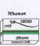
বিবিএফএল সোর্ড স্ট্রিং ব্রড বেল্লার