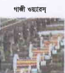
গালী ওয়্যার ভানার তার (এসইসি, এলি, এইচ ভিনিসি)