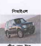
পিআইএল জীপ, বাস, ট্রাক