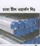
ঢাকা স্টিল ওয়ার্কস লিমিটেড এস এস হুড ও বার সামগ্রী